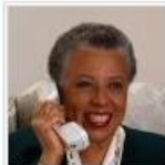
Advocating for Older Citizens