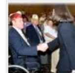
Defending Your Rights