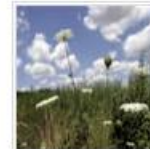
Protecting the Environment