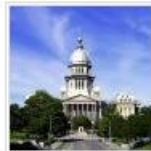
Ensuring Open and Honest Government