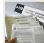
Building Better Charities

Monday, January 14, 2019 ATTORNEY GENERAL KWAME RAOUL SWORN IN AS ILLINOIS' 42ND ATTORNEY GENERAL AG Pledges to Protect Rights of Illinois' Diverse Population, Announces Top Administration Appointments Read more »