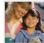
Advocating for Women