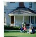
Keeping Communities Safe